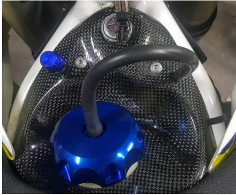
requires drilling 2x 8mm holes into carbon cover