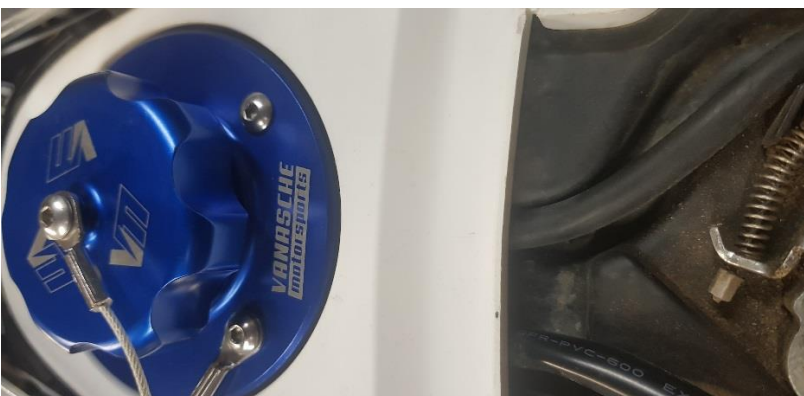
This breather hose connects to tee at front of bike. use extended hose