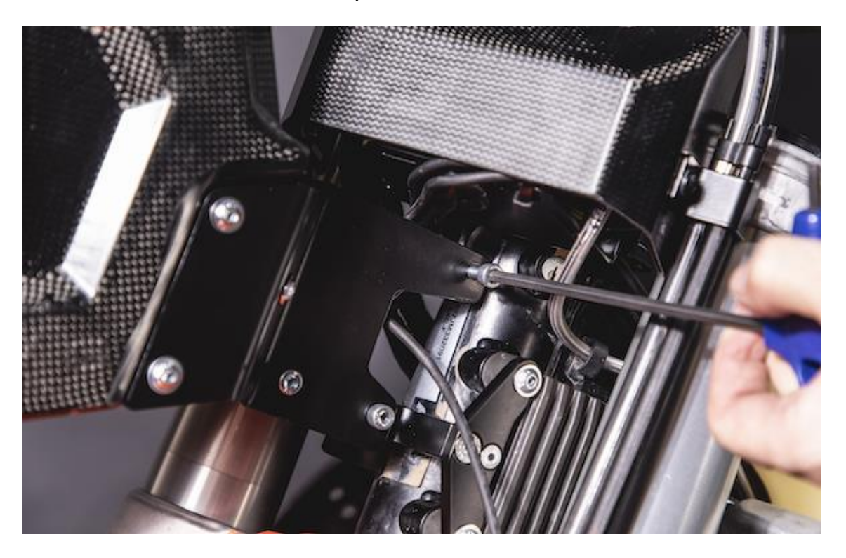
b/ Prepare the second power cable extension – the "switch on" one. You plug it into the headlight socket. Again, you have to be careful as there is space only for one hand in the tower.

Now tighten the tower and then the right side low clamps. When you tight the bolts try to balance the force between the tower and clamps.