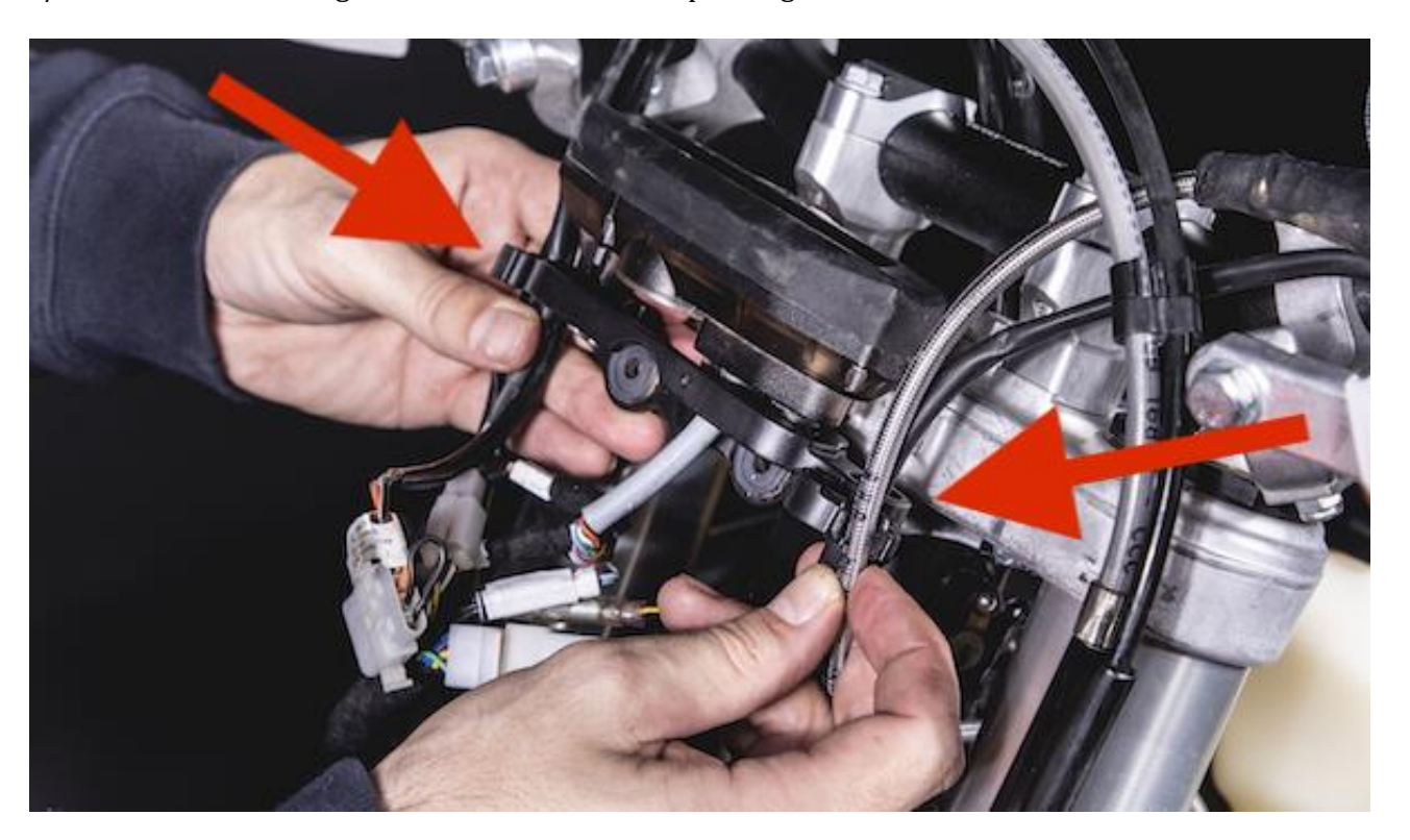
b/ Mount the cable and speedo holder and mount the bracket into the top triple clamps with supplied M6 bolts.

a/ Put the cables coming from handlebars into the plastic guides.