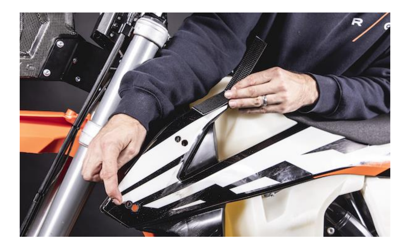
c/ Insert the rubber nuts into the fairing holder and finally mount the fairing on ©

b/ Now depends what kind of tank you have on your bike. You can either drill 9,5 mm hole into the OEM side panels and insert the rubber nut and bolt on. Or use the special 3M Velcro or combination of both (we have four holes in the picture because of fitting with different tanks during development – you need max. two holes on each side)