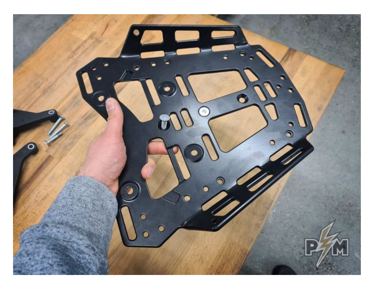
4. Install the rack back to the bike.