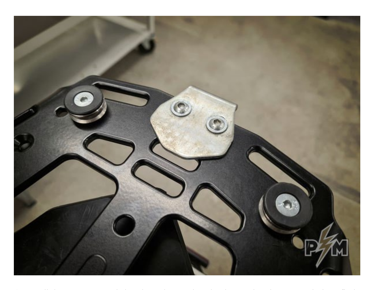
4. Install the top case and the close the top box latch. Let the sheet metal place finds its position. Remove the top case and tighten sheet metal part.