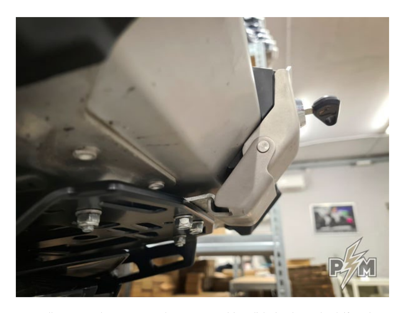
5. Install SW-Motech top case. Make sure everything clicks in place. Check if top box is firm and secure. If needed, readjust the position of sheet metal flange.