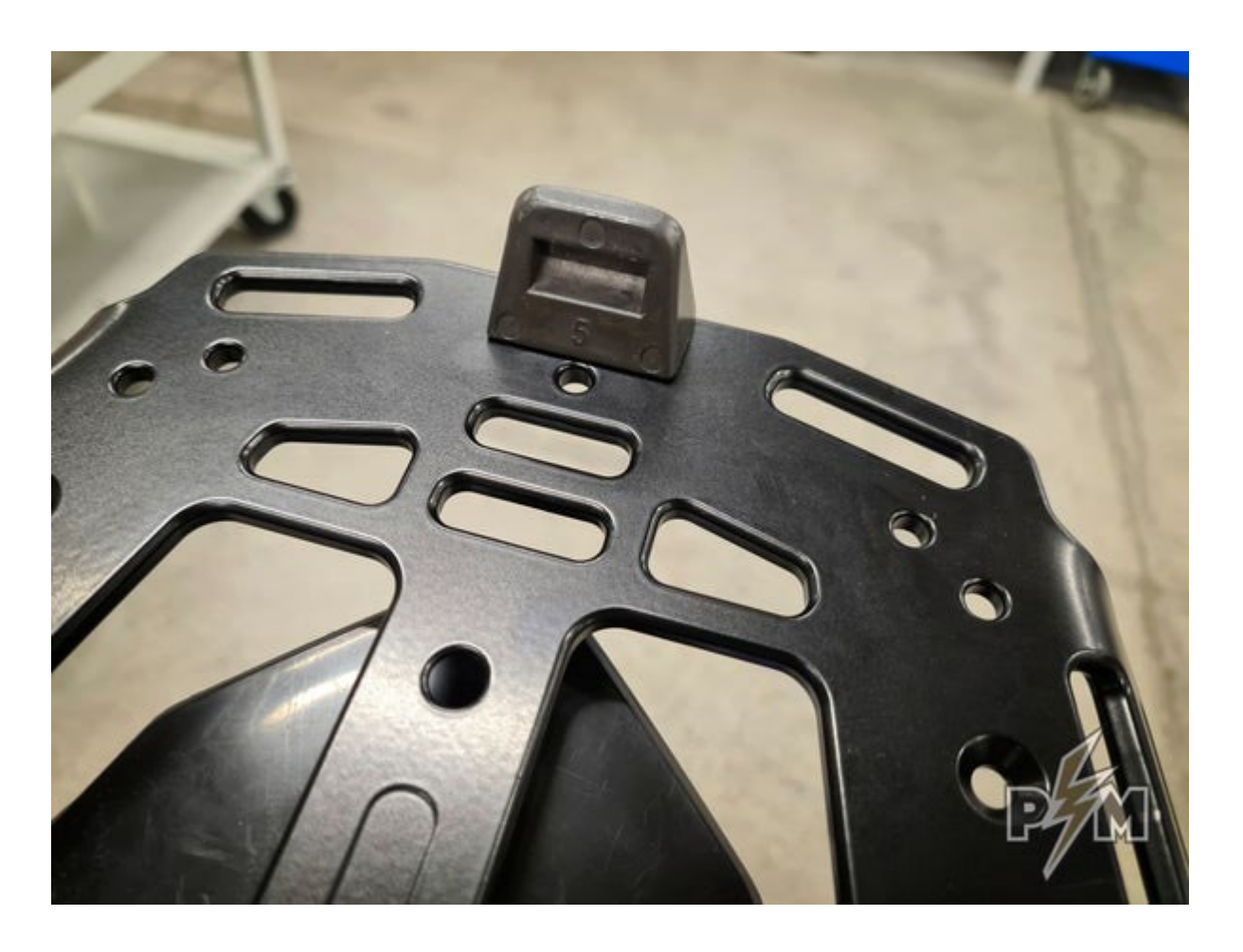
4. Insert rubber grommets as shown bellow. Make sure the rubber grommets are properly seated. Use drop of super glue to make sure grommets will stay in place.