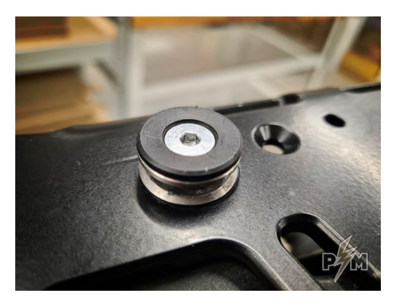
3. Install the sheet metal part as shown below. Tighten by hand.