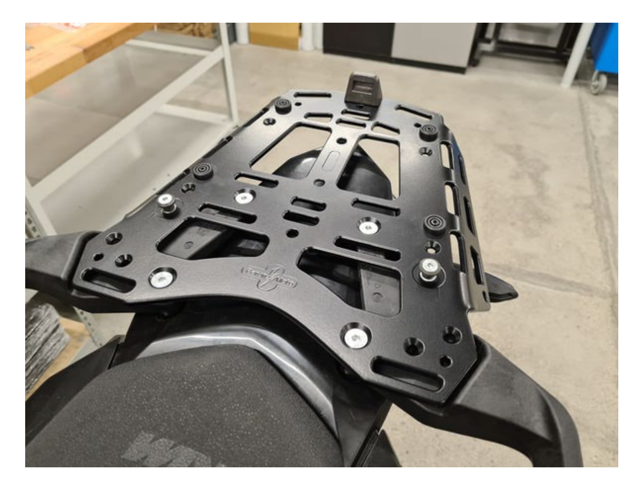
5. Install Givi or Kappa Monokey top case. Make sure everything clicks in place. Check if top box is firm and secure.