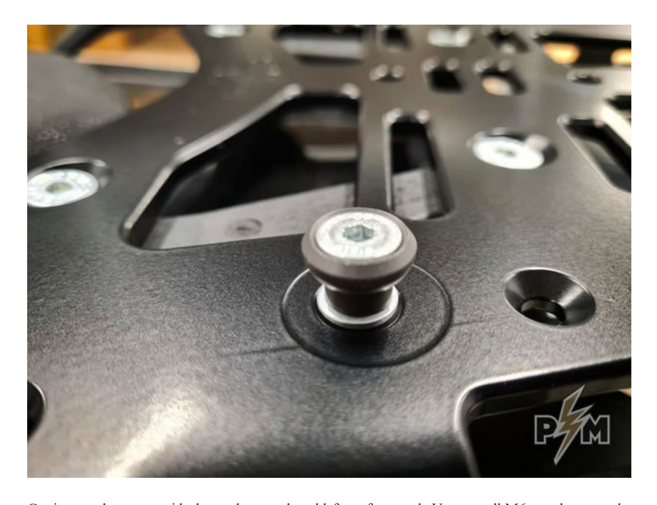
Cavity on the pyramid shaped part should face forward. Use small M6 washers and M6x16 button head bolts on the underside. As shown bellow.