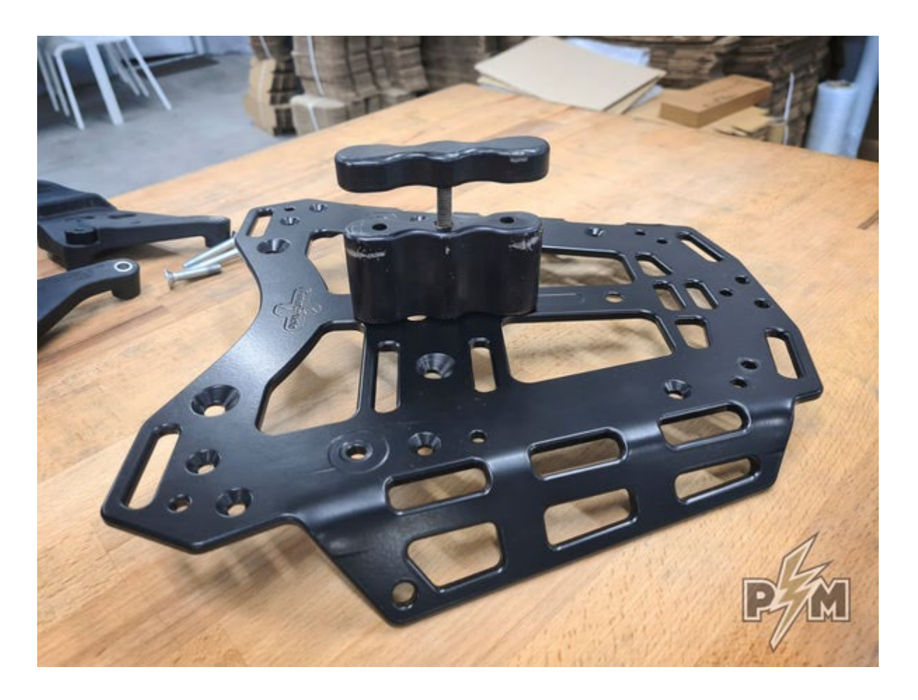
3. Use appropriate bolts to secure the Rotopax mount from underside of the rack. Tighten the bolts.