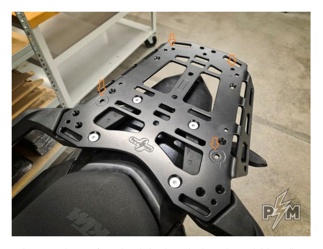
Make sure to place two forward pucks into large circular pockets and tighten all bolts. Do not overtighten, as plastic covers can be deformed.