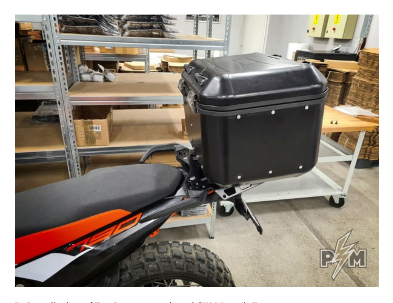
D. Installation of Top Luggage rack and SW-Motech Top case

1. <u>SW-Motech Adapter kit for Trax needed</u> (purchased separately).