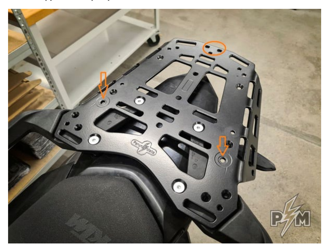
IMPORTANT: Insert M6 small washer under each mushroom shaped part. Locate the part in the smaller circular pocket. As shown bellow.

2. Position the hardware on the marked locations. Mushroom looked parts at the front and pyramid shaped part at the rear.